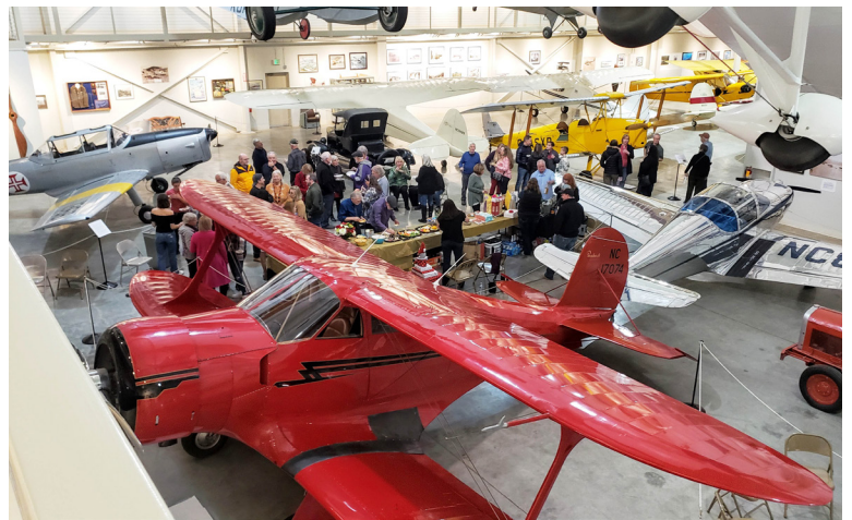
A special event becomes extra special in the Aero Museum!

Aero Museum, you might want to consider August 3rd 2024 for your date. On August 3rd the aero museum will be co-hosting the "Jefferson County Airport Day" along with the Port of Port Townsend. The event will run from 10:00 AM until 3:00 PM. This will be the 100th year anniversary for the Port of Port Townsend, and Airport Day will include antique and modern aircraft on display to the public, a classic car show on the infield, hot air balloon rides, helicopter rides, food, live music, and much more. So be sure to mark it on your calendar! On October 26th the Port Townsend Aero Museum will host our annual dinner auction fundraising event. This year our caterer, GBF Catering, will be returning to a sit-down style dinner rather than hors d'oeuvres as we have done the last few years. This is an invitation only event with limited seating and we'll be sending out invitations this September.