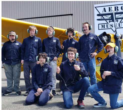
A special thanks to the David Clark headset company who for many years has repaired our PTAM DC headsets for No Charge!