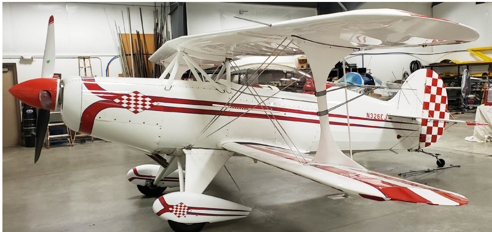
This beautiful Skybolt was donated to PTAM this spring by a long time supporter.