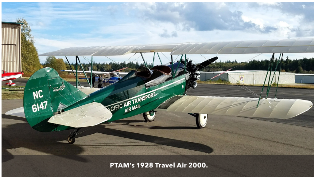
PTAM's 1928 Travel Air 2000.