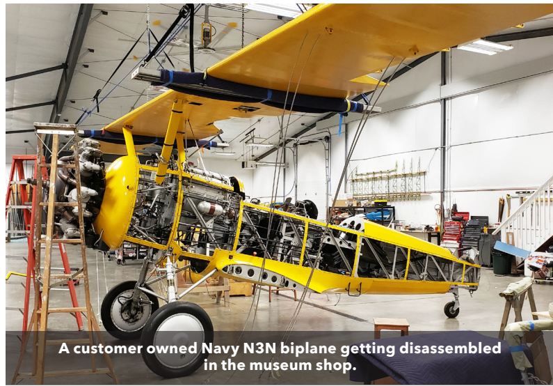
A customer owned Navy N3N biplane getting disassembled in the museum shop.