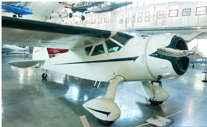
PTAM's 1938 Cessna Airmaster on display!