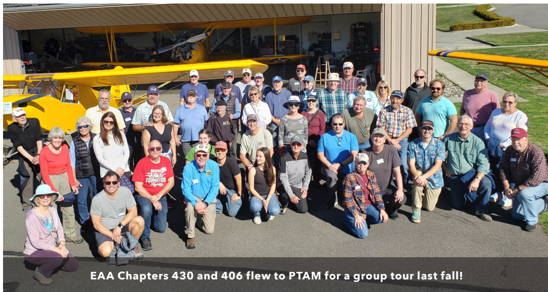
EAA Chapters 430 and 406 flew to PTAM for a group tour last fall!

In keeping with the museum's mission of restoration, preservation and operation of classic and antique aircraft through the involvement of our teenage volunteers, this last February we added another flying aircraft to our collection. When