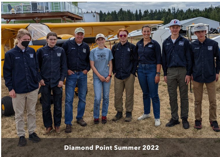
Diamond Point Summer 2022