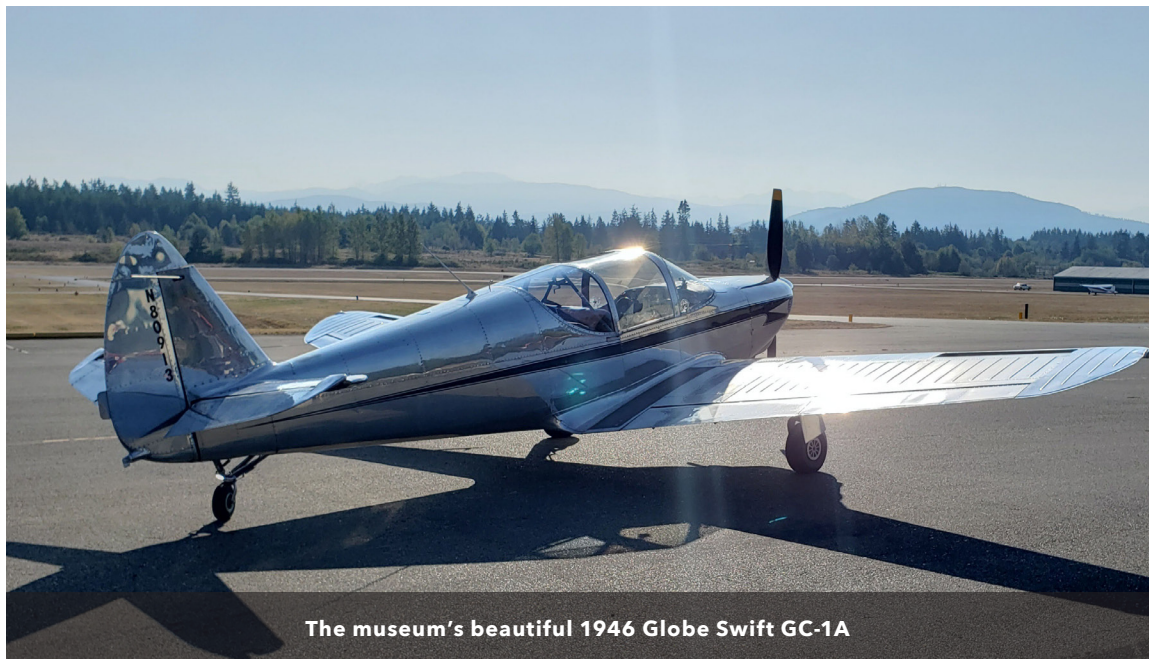
The museum's beautiful 1946 Globe Swift GC-1A

Jefferson County International Airport Port Townsend, Washington