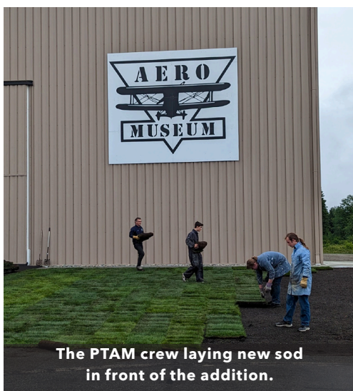
The PTAM crew laying new sod in front of the addition.