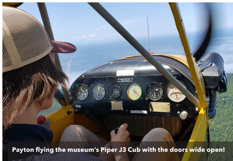
Payton flying the museum's Piper J3 Cub with the doors wide open!