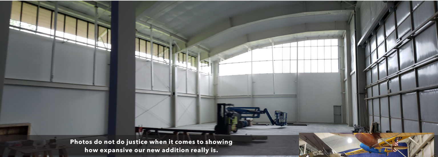
Photos do not do justice when it comes to showing how expansive our new addition really is.