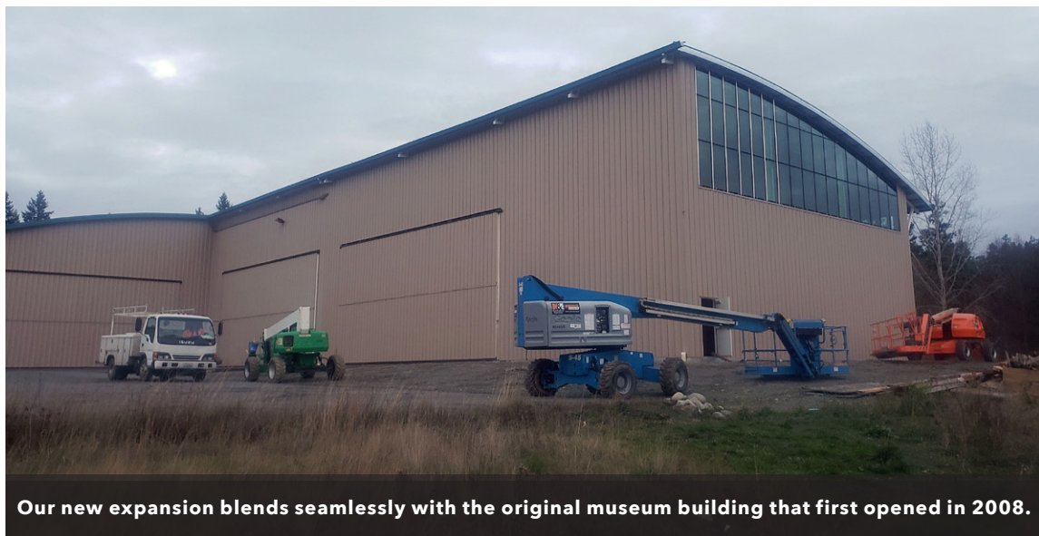
Our new expansion blends seamlessly with the original museum building that first opened in 2008.

Summer is upon us, and along with its fantastic flying weather comes the Port Townsend Aero Museum's summer newsletter. With many of our youth volunteers now finished with school for the year, PTAM is looking forward to a season filled with accomplished goals and finished projects. Museum operations are in full swing, and we're happy to announce new developments and fresh faces this year.