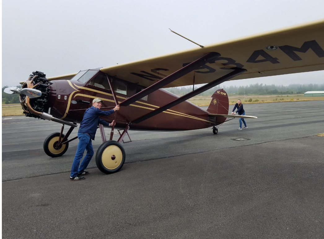
Annie and Caleb moving the 1930 Stinson SM-8 that was recently donated by Earl Root.

With all the talk of our expanding aircraft collection, it may or may not be obvious we are facing a very serious problem at the Port Townsend Aero Museum, and that is one of space, or more accurately, our lack of space to display and maintain the aircraft in our collection. Currently we have 26 aircraft on display in our main building all of which are owned by the Port Townsend Aero Museum. This building is full of beautifully restored antique and classic aircraft, parked as close together as we dare without damage, but we are out of space. As of this writing, we have eleven additional museum aircraft that are nearly finished and ready for display, being restored, or are in the queue waiting for restoration, all of which will need display