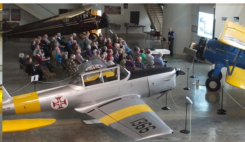
Jefferson Land Trust hosting a speaker discussing the effects of volcanic activity on aviation.