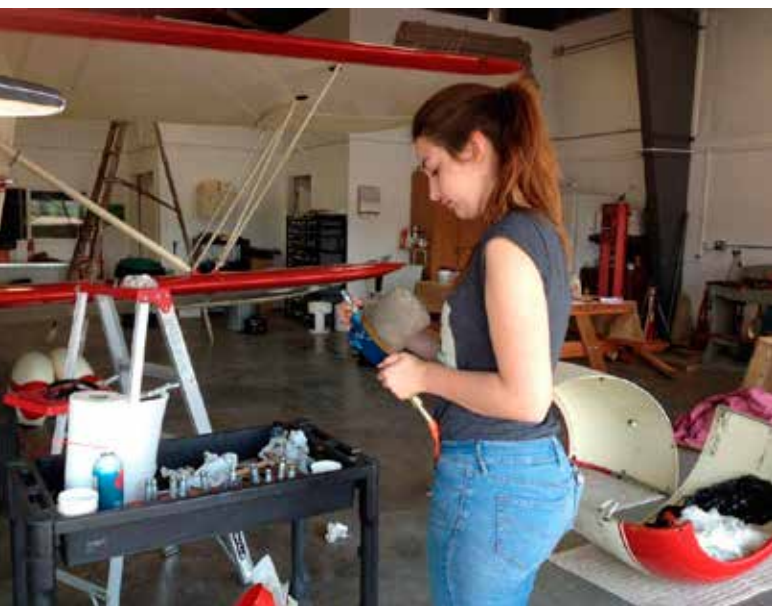
Another volunteer youth cleaning spark plugs.