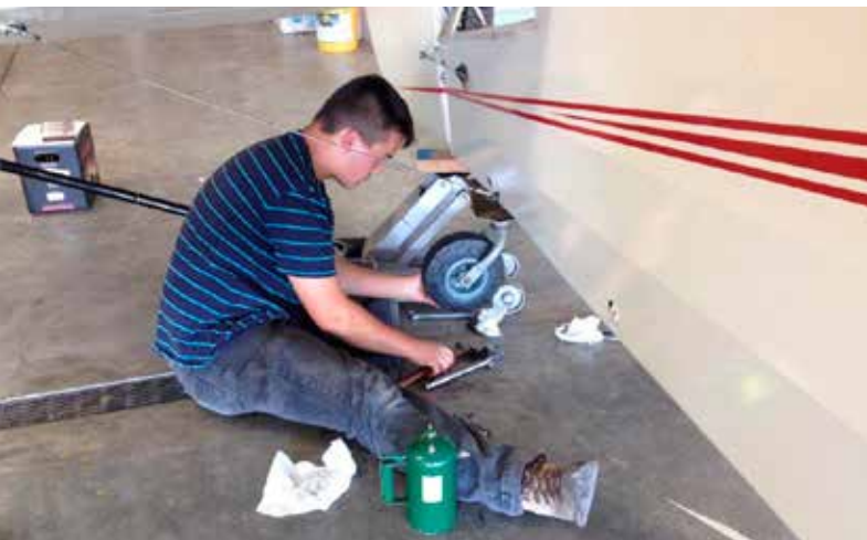
Twist that tail wheel . . .