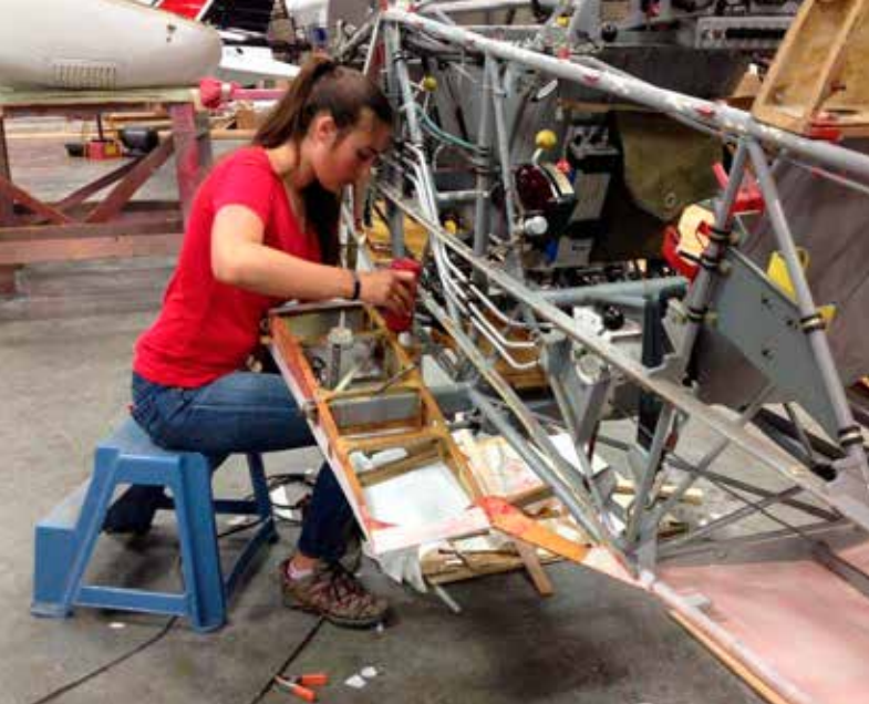
Stitch that fabric . . .