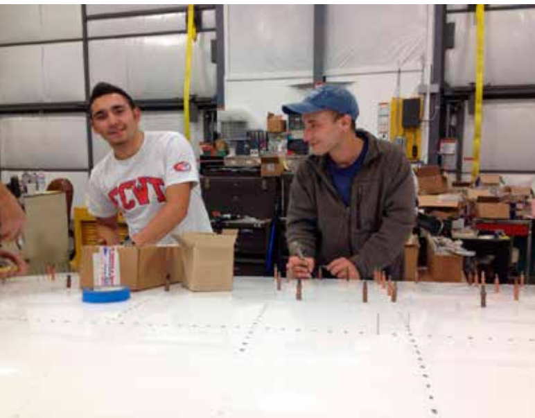
More volunteer youth setting rivets.