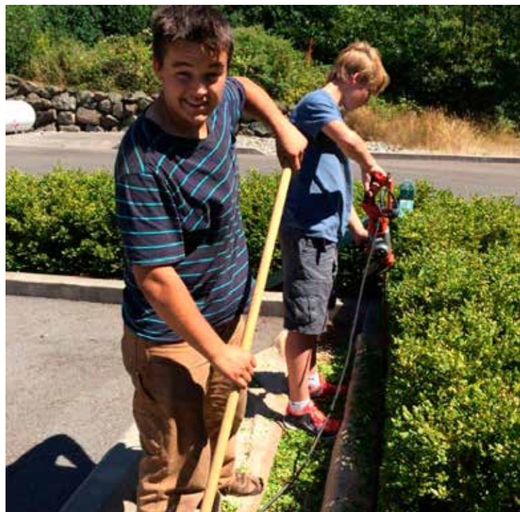
Not all the jobs are glamorous but our volunteers pitch in where ever needed