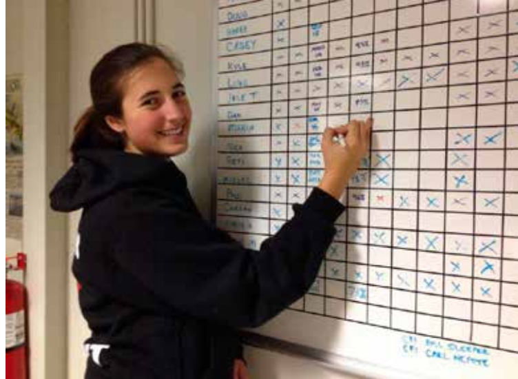
A sixteenth birthday Solo goes up on the board.

Obviously, I am happy with these people! I would like to know what others are doing, but it is easy to lose track of them. They are all very special, but I didn't know that when