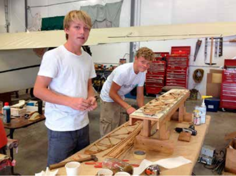
A couple of our volunteer youth building a wing.