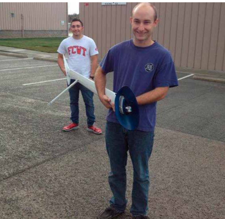
Tote that bale or strut . . .

they started at PTAM. Our present people are all special and will excel in the future. We are very close to straight ‘A’ averages for all of them. They recognize the value of having top grades when they begin college. None of what they have done has been easy. They don’t just arrive at birth with all their achievements. They work very hard to please themselves, their parents, their teachers, and to a degree, the museum board. They know they’re special, and continue to strive to be better.