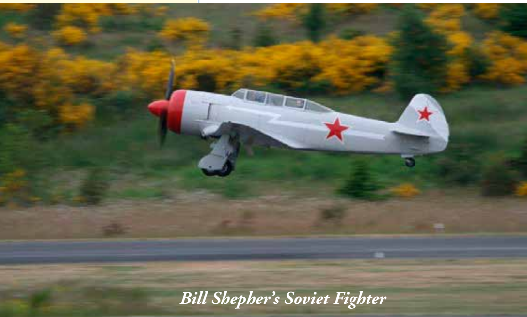
Bill Shepherd's Soviet Fighter

We would not be able to handle this much work in a timely manner if we didn't have some of our best assets: the youth volunteers! Some of our kids are now young adults, and have been with us for so long, they can and do operate the museum. They are seasoned re-builders able to accomplish many of the processes required to finish a restoration of an antique airplane, and they also provide the newer volunteers the needed training. Without these loyal volunteers, we would be overwhelmed. Many of you will recognize these people and how they have grown, in these accompanying pictures.